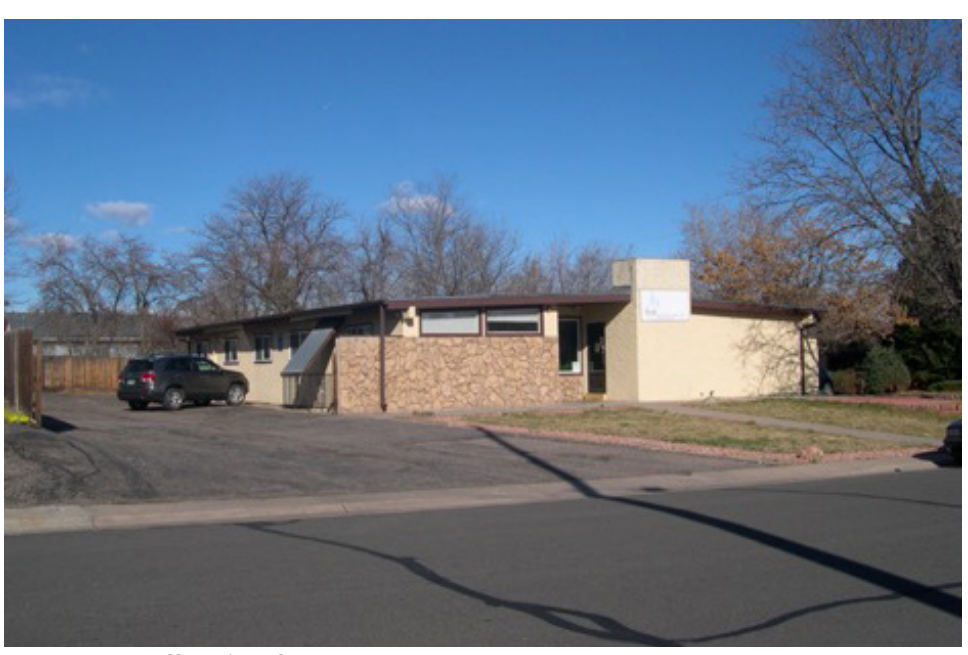
BF Borgers CPA office, photo from Loopnet.com

If you don't love Borgers for the clients, perhaps the charming offices.